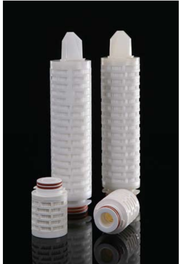
Note: TETPOR is a registered trademark of Parker domnick hunter